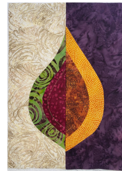
Example of two different halves sewn into one full Leaf Block

leaf must be 1" from the bottom of the background.